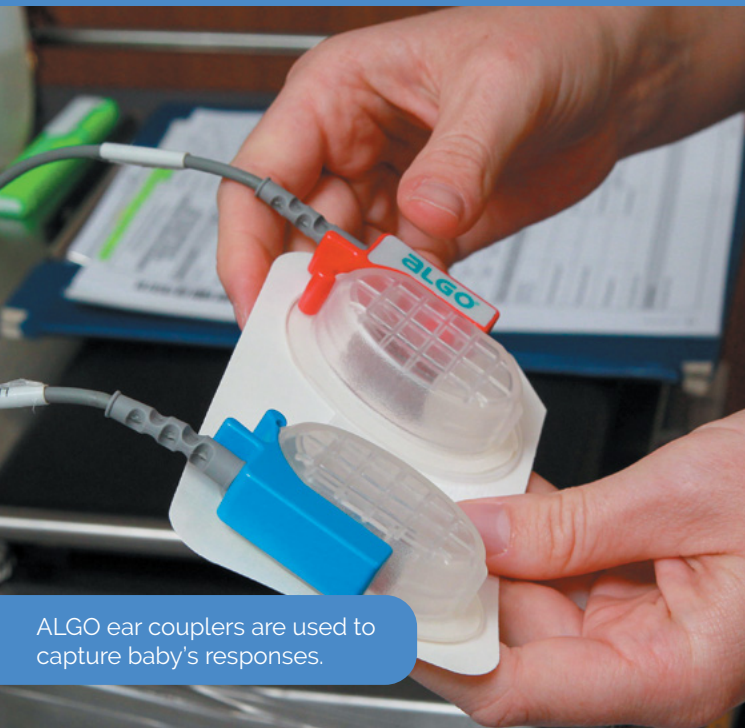
ALGO ear couplers are used to capture baby's responses.